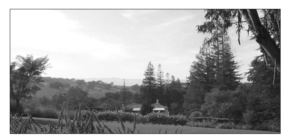
View from the San Juan Hill garden of one of the homes on the 17<sup>th</sup> Annual Holiday House Tour.